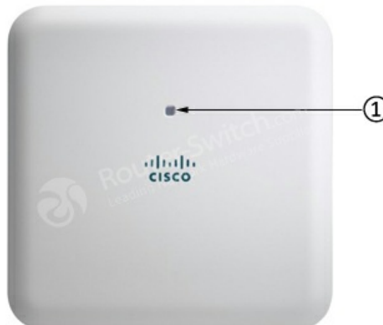
Figure 1 shows the AIR-AP1832I LED Indicator Position.