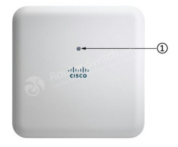
Figure 1 shows the AIR-AP1832I LED Indicator Position.