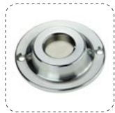
EAS-D01: Normal Detacher 4500GS