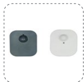
EAS-H02: Big Square