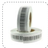
EAS-L404: RF Soft Label 40 * 40 (mm)