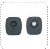
EAS-H01: Small Square