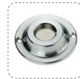
EAS-D01: Normal Detacher 4500GS