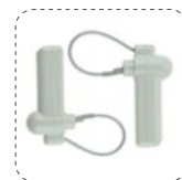
EAS-H14A: Tag with Lanyard