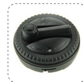
EAS-301: Spider Tag