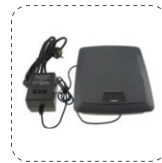
EAS-D886: AM Deactivator