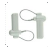
EAS-H14A: Tag with Lanyard