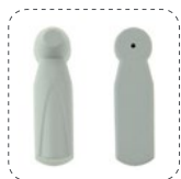
EAS-H30: Small Pencil