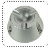
EAS-D10N: Universal Detacher 10000GS