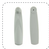
EAS-H32C: Big Flat Pencil