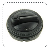
EAS-301: Spider Tag