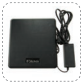
EAS-769B: RF Plastic Deactivator