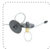
EAS-H22C: Bottle Tag